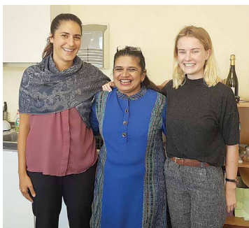
At FIGO Headquarters in London

Around the world REPRESENTING INDIA AT VARIOUS FORUMS