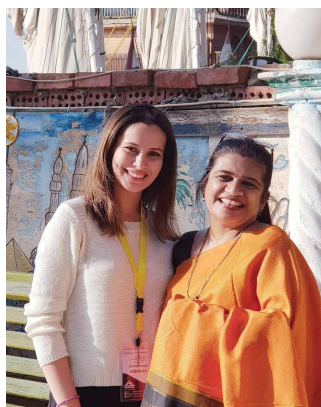
Student from Egypt eager to learn at Divakars