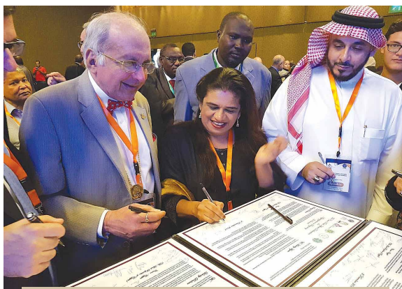
Signing the Cairo Declaration on Diabetes