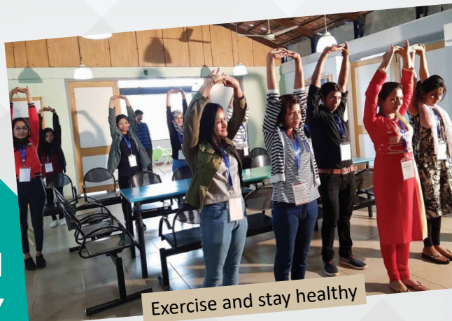
Exercise and stay healthy