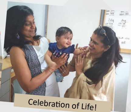
Celebration of Life!